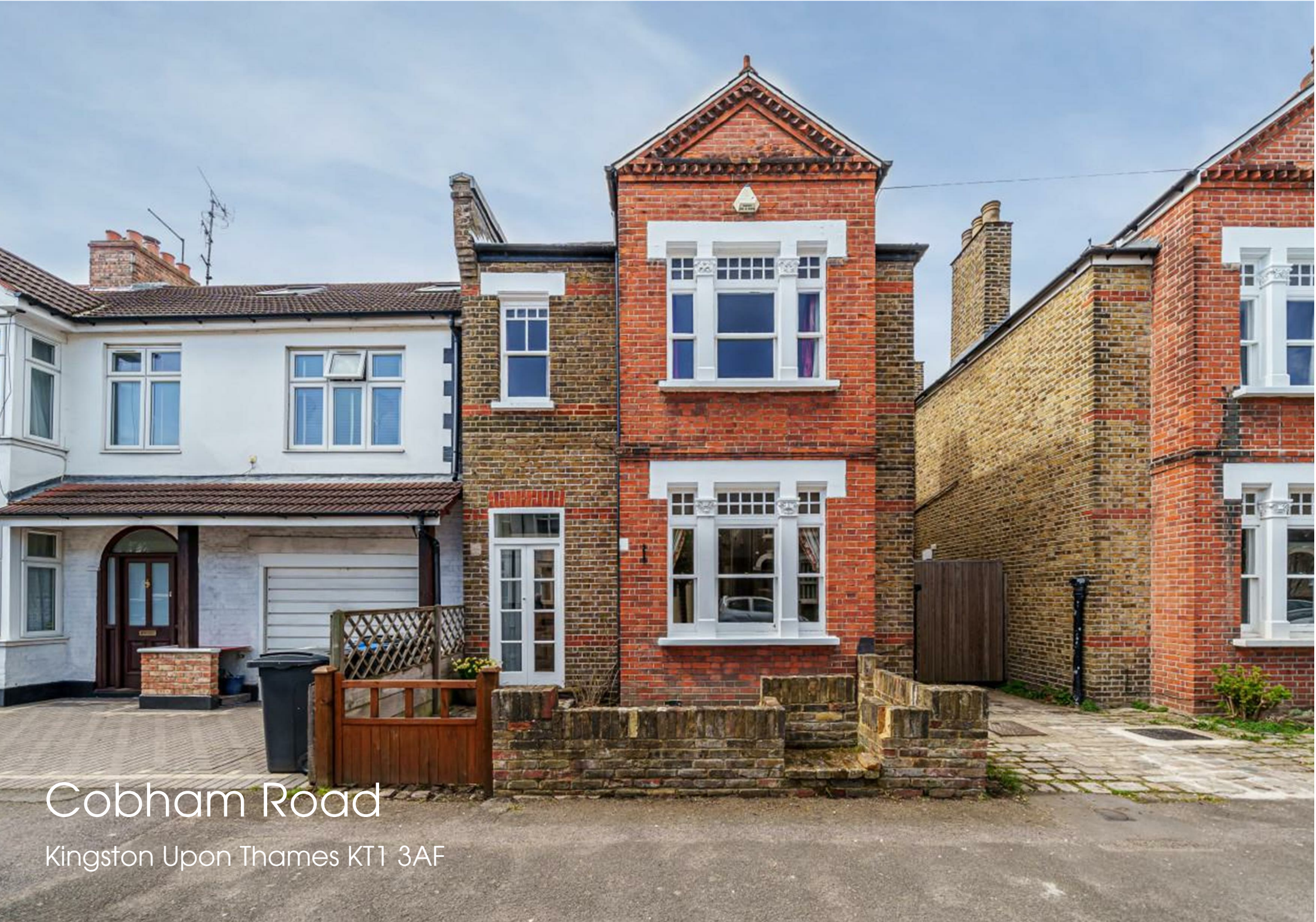
Cobham Road Kingston Upon Thames KT1 3AF